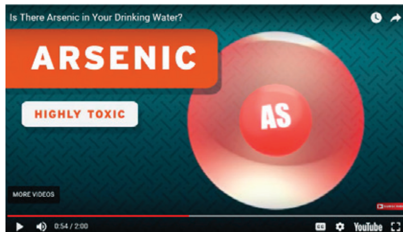
FIGURE 2. Screenshot of informational video on arsenic in private wells produced by SHL with support from CHEEC. The video can be found on the CHEEC website at: https://cheec.uiowa.edu/outreach/resources .

CHEEC also provides support to the State Hygienic Laboratory and Iowa State University's Extension and Outreach 4-H Program. These efforts aim to increase awareness about the possible presence of arsenic in private well water and increase the number of wells tested. The project created materials and sessions to teach youth about arsenic contamination in private wells, its health risks, and the process for detection and treatment. The educational program was an extension of the State Hygienic Laboratory's Iowa Well Survey (IWS) program, which was conducted in 15 counties. A video created for this project (Figure 2) can be found on CHEEC's website at https://cheec.uiowa.edu/outreach/resources .